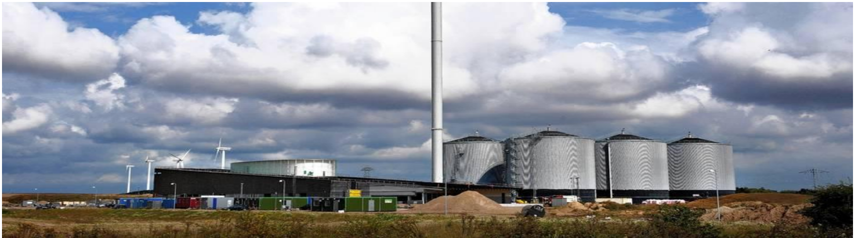
Maabjerg Energy Concept, biogas plant, Måbjerg, Denmark